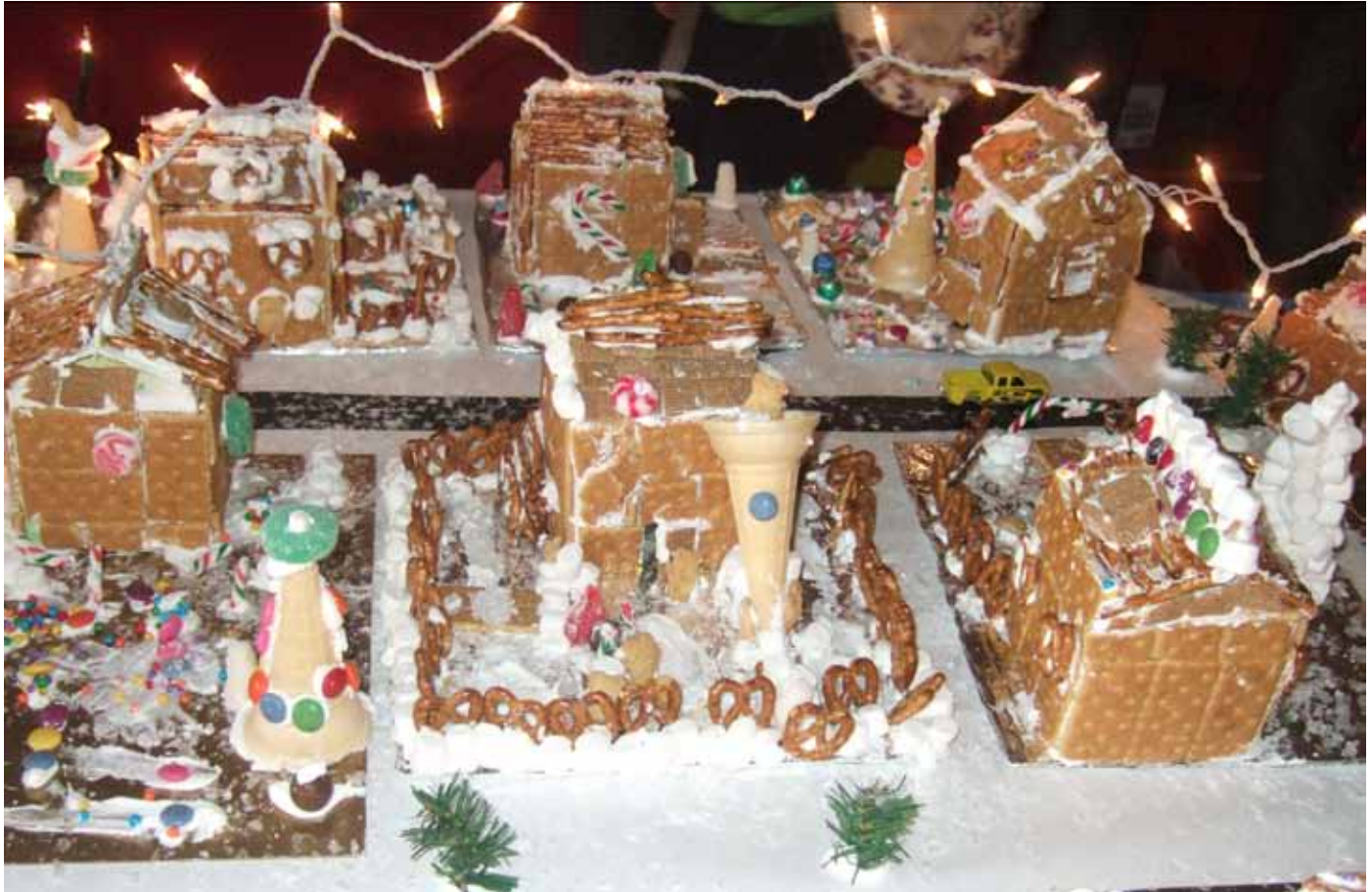
Gingerbread houses at Gordon are only a part of the school's large array of decorations...